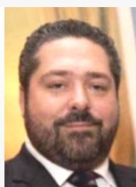
Honorary President H.I.H. Grand Duke of Russia George Mikhailovich Romanoff