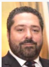
Honorary President H.I.H. Grand Duke of Russia George Mikhailovich Romanoff