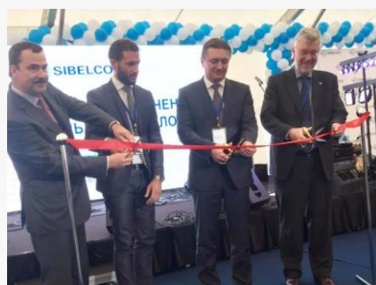
SIBELCO NEW LINE OPENING

In the Moscow region of Ramenskoye, the Sibelco Russia workshop was opened to crush industrial minerals, the enterprise was put into operation in 2017 third quarter