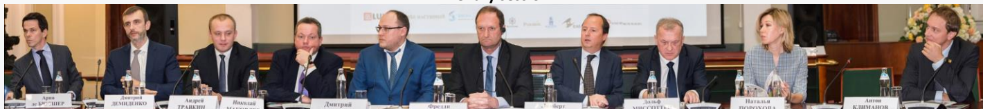
1 st Business Session