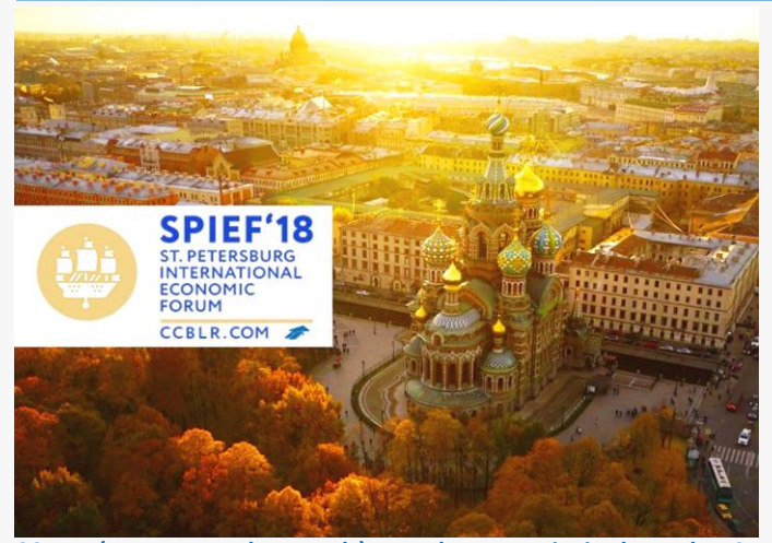
CCBLR (Moscow and Brussels) members are invited to the St. Petersburg International Economic Forum 2018, which will take place in St. Petersburg on May 24–26.

Hence, aware of the need for more intensive and quality cooperation between Yaroslavl administrations and Belgian-Luxembourg Chamber of Commerce in the implementation of activities aimed at better and more efficient presentation of BLCC member's benefits they agreed that cooperation will be based on the principles of partnership and transparency. The Russian Investment Forum brought together representatives of the federal and regional authorities, leading economists and entrepreneurs, and the heads of major domestic and foreign companies.