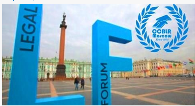
BLCC is a media partner of SPBILF - a unique international conference that brings together the leading minds of the legal profession.

The annual St. Petersburg International Legal Forum (SPBILF), founded in 2011, is organized with the support of the Ministry of Justice of the Russian Federation and the President of the Russian Federation. Over the years, the SPBILF has emerged as a foremost international platform for discussing a broad range of urgent questions confronting the contemporary international community of legal professionals.