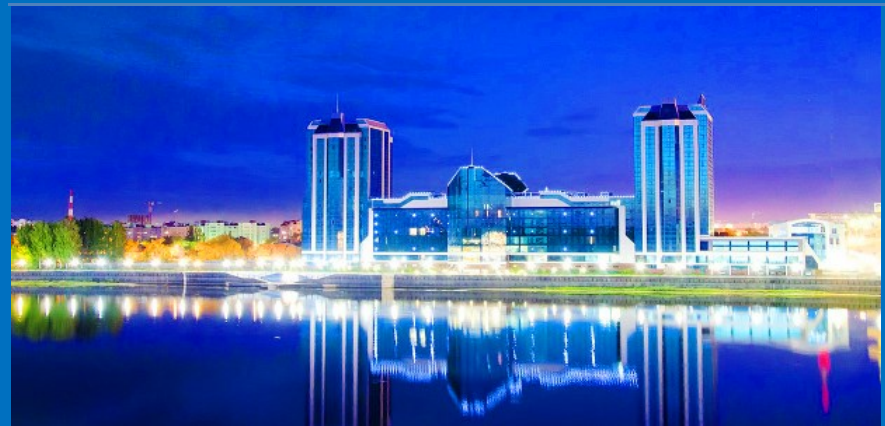
Grand Hotel Astrakhan

A fantastic opportunity to achieve and enlarge your business goals, don't miss out.